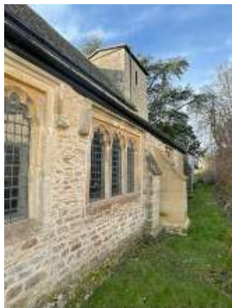
Pictured left and above: The North Chapel dating to 1450